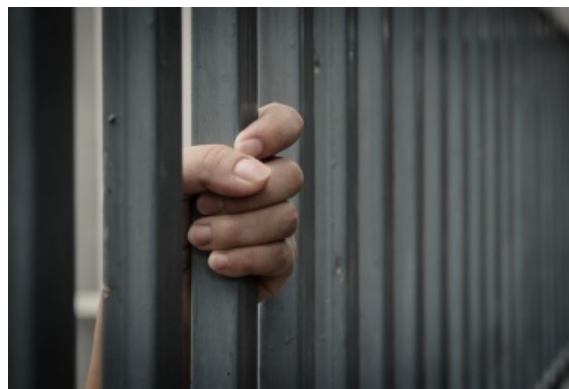
I had been in jail for two and a half months when I learned that my breast cancer would necessitate a mastectomy. And I would have to do it alone: no pink pillows, no encouraging cards, no special foods. No comfort, period.

It's 2 a.m., and the dirty cream halls of the jail are bustling with the clang and clash of guards dragging chains behind them, attaching shackles and handcuffs to 50 female inmates to prepare us for the outside world. But unlike everyone else standing restlessly against the wall, I'm not going to court or trial. I'm going the hospital to have my breast cut off.