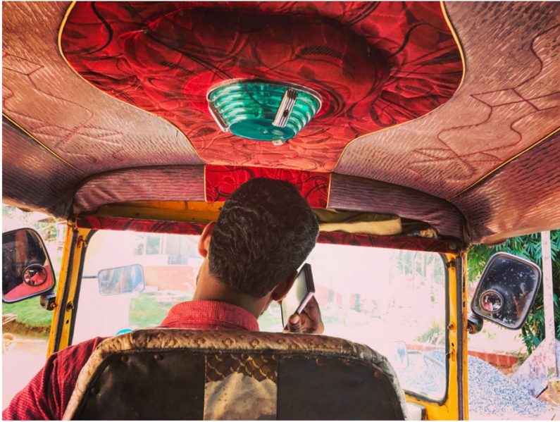
Figure 2. Iliyas' Aunty Auto.

Auntiness also is not just method from the perspective of the researcher's identity, it is also method in that it influences how others respond to the researcher. In Adjepong's account, for example, they detail a way in which an aunty at one of the parties they were at for fieldwork 'pulled them to the dance floor' and whispered, 'why would you leave together when we can dance like this?' It is revealing how Adjepong's flexible identity allowed for a particular space beyond their interiority for others in the field to occupy—the possibility it gave, in this case, the possibility for the aunty dancing with them to articulate a queer desire that they might not otherwise have. This is not to say there isn't discomfort or even violence in that assumed space. Adjepong mentions in the same narrative that as the aunty 'wrapped her arms' around their shoulders and 'closed the space between', they 'tried to remain relaxed' because they were 'trying to say yes to more, to loosen up'. This stifling juxtaposed with the expansion it might have offered illustrates exactly the clash and contradictions that LaWhore Vagistan 47 urges us to embody within our aunty interactions. It is precisely within this complicated milieu of affect that there lie crucial tools for self-reflexive inquiry.