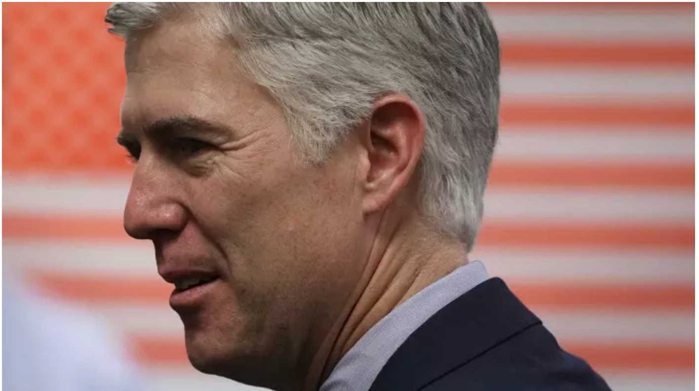
Neil Gorsuch, Trump's US Supreme Court nominee, reportedly said the president's attacks were 'demoralising'

Over the past week, Mr Trump has denigrated the district court judge in Seattle who blocked his 120-day global ban on refugee admissions and 90-day halt to arrivals from seven majority-Muslim nations and questioned the competence of an appeals court. The president referred to a “so-called judge” and said even a “bad high school student would understand” that he has the authority to limit entry to the US.