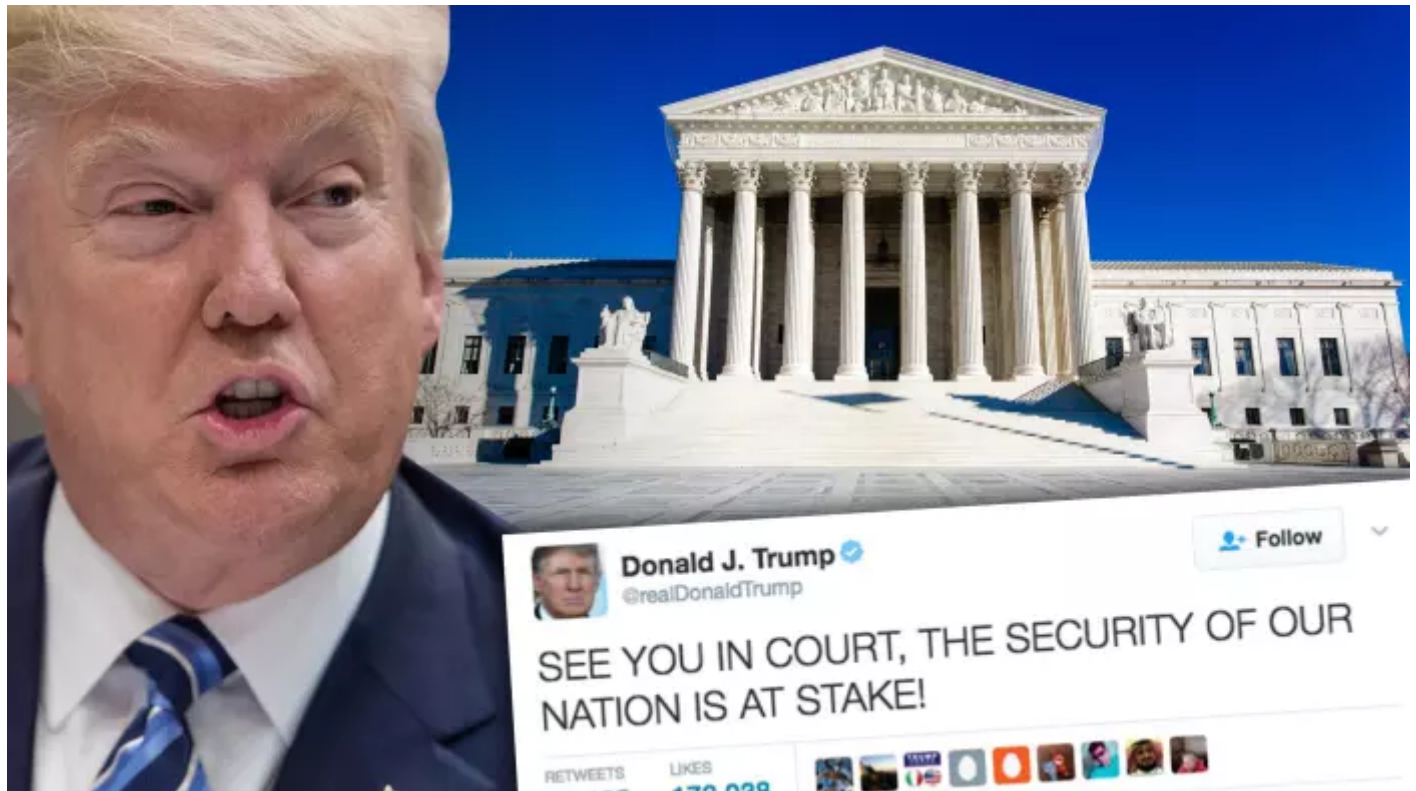
Donald Trump's clash with the judiciary over his travel ban is likely to be taken to the highest level

After loss in appeals court, questions mount over how far rhetorical fight will go